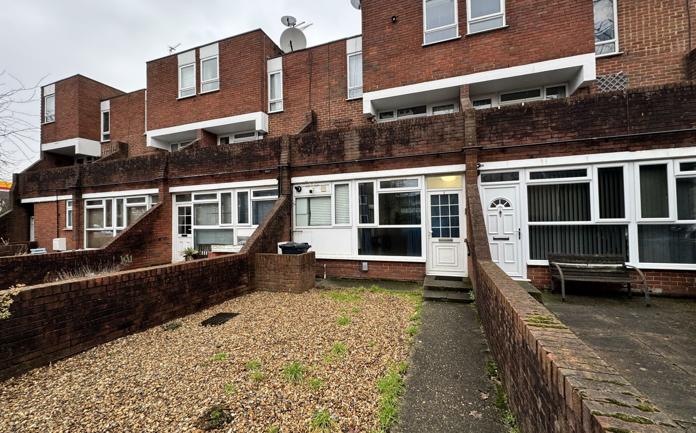
2 Maynard Court Clarence Road, Windsor, Berkshire, SL4 5BG £250,000